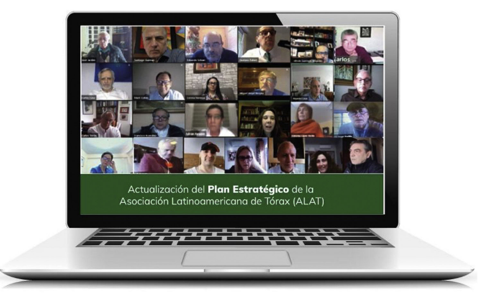
Figure 1. Participants in the ALAT Strategic Plan 2021–2026.