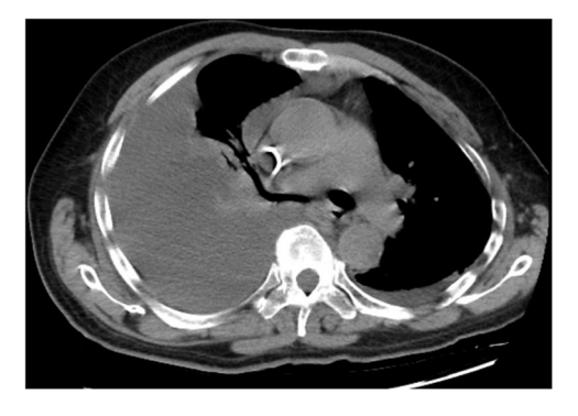
Fig. 1A. Computed tomography of the chest revealed Large right pleural effusion nearly fills the right thoracic cavity.