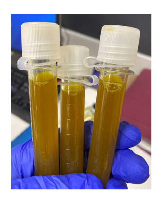
Fig. 1B. Dark green "Bilothorax" pleural fluid.

Bilothorax is a rare cause of pleural effusion. The most common etiologies are biliary obstruction as in our case, diaphragmatic trauma, and iatrogenic complication of percutaneous hepatobiliary drain insertion. Most cases of bilothorax are located on right side, in extremely rare case, bilothorax can represent as bilateral pleural effusion. The pleural fluid to serum (PF/S) bilirubin ratio greater than one is highly suggestive of bilothorax, with higher ratios making the diagnosis more likely. Almost half of the bilious pleural effusions are infected and require immediate drainage of the effusion along with early administration of antibiotics to prevent