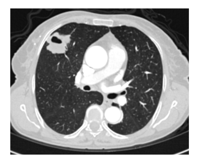
Fig. 3. Axial thoracic CT scan with lung parenchyma window of a 61-year-old female patient showing a metastatic mass with a diameter greater than 3 cm, mimicking a mass lesion located adjacent to the pleura in the right lung with central cavity and peripheral spicular extensions. The patient has been followed for 4 years due to PAE.

A relationship was identified between the pleura and one or more of the lesions in 25 of the 34 patients diagnosed with PAE (73.5%) (Fig. 1). Following the lesion-pleura relationship, multiple lesions were uniformly scattered throughout the bilateral lung parenchyma in 19 patients (55.8%), seven patients (20.6%) presented with a solitary pulmonary lesion and three patients (8.8%) had multiple unilateral lesions. The diameter of one or more lesions was greater than 3 cm in 11 patients (32.4%), only three patients (8.8%) had conglomerated lesions (Fig. 2) and seven patients (20.6%) showed cavitization in some of the lesions. The majority of cavitary mass measured greater than 3 cm (Fig. 3). Calcified lesions were recorded in five patients (14.7%), and some of the calcified lesions with lobulated contours had a typical popcorn appearance. Lobulated contours were observed in a significant proportion