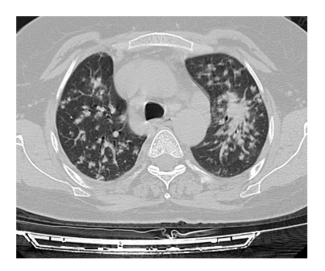
Fig. 4. Axial thoracic CT scan with lung parenchyma window of a 58-year-old female patient showing micronodular densities with uniform dispersion in bilateral lung parenchyma. The patient has been followed for 4 years due to PAE.

of non-calcified lesions. Some of the lesions had irregular contours and spicular extensions mimicking malignant processes in five patients (14.7%), while three patients (8.8%) showed multiple micronodular densities with a bilateral uniform dispersion pattern (Fig. 4). The appearance of pulmonary involvement resembled miliary tuberculosis. Parenchymal lesions were accompanied by pleural effusion and parenchymal consolidation in only three patients (8.8%) (Table 1).