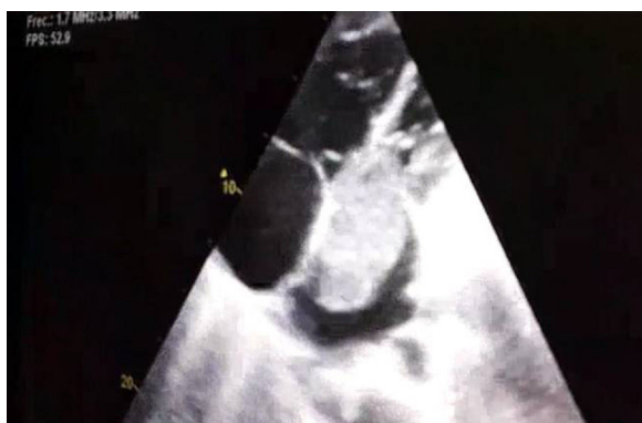
Fig. 1. Echocardiography showing a large mass in the left atrium (6.3×3.2 cm) in diastole protruding into the left ventricle.

clots. A thrombophilia study was also requested, and the patient was found to be a heterozygous carrier of the factor V Leiden mutation.