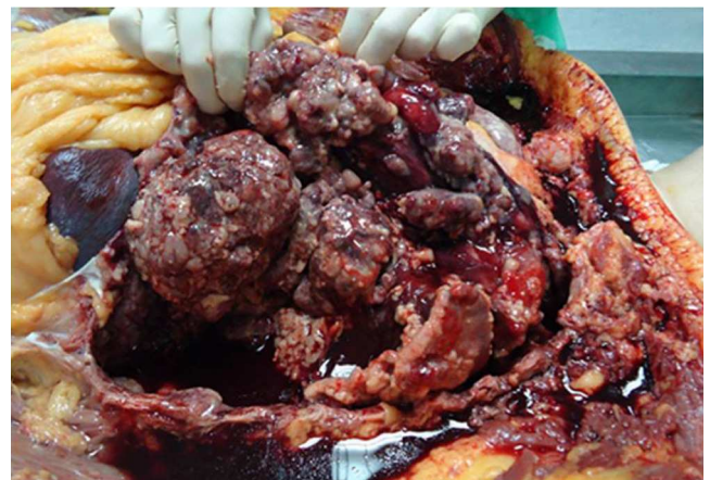
Fig. 1. Image of the thoracic cavity during autopsy: multiple nodular neoplastic implants are seen in the visceral pleura, along with a moderate amount of serous, bloody pleural fluid.

In conclusion, our patient's presentation and progress is similar to the pattern observed in the literature to date, although the time between appearance of the primary tumor and respiratory symptoms was shorter, so her death, 6 months after diagnosis, was earlier. Her disease also appeared to be more aggressive than cases reported by other authors, with metastasis in the surgical site and in distant sites, developing within a very short period of time. Thus, in the case of anaplastic ependymoma WHO grade III, pleuropulmonary involvement must be taken into consideration as a possible complication, even shortly after the appearance of the intracranial lesion, as was the case in our patient.