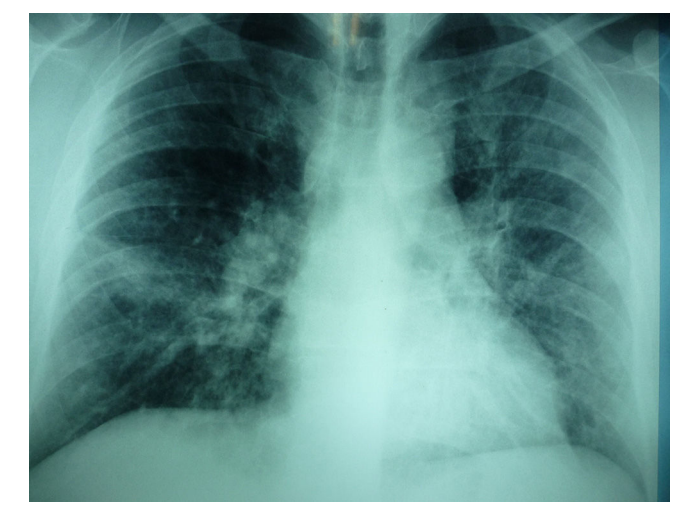
Fig. 1. Chest X-ray of the patient at hospital admission showing alveolar infiltrates, diffuse and expanded throughout the whole left lung and the right middle lung field.

far had underlying disorders, such as HIV infection, multiple myeloma, pulmonary fibrosis, systemic lupus erythematosus, and autoimmune hemolytic anemia, or had undergone liver transplantation. All but one patient died. Since the clearance of L. maceachernii from the lungs of infected mice has shown to be relatively quick compared to other species,<sup>4</sup> the increased mortality