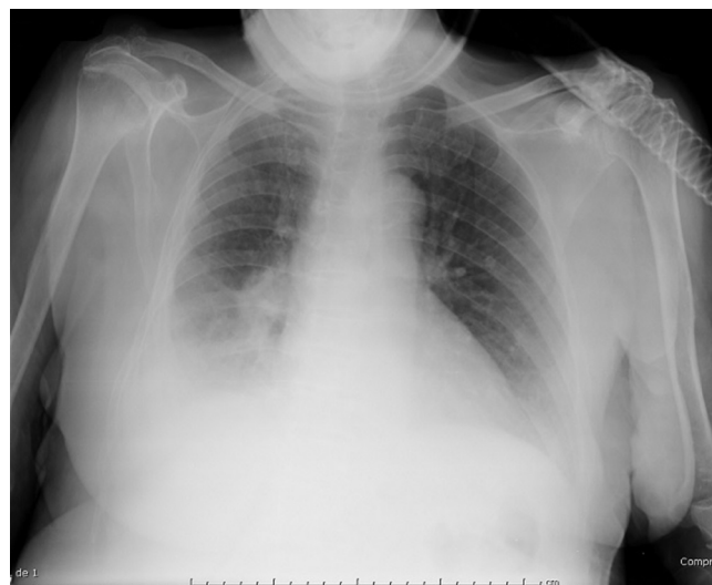
Fig. 2. Absence of right upper lobe atelectasis after non-invasive ventilation. Infiltration can be seen in the right lower lobe.

Atelectasis may be prevented with respiratory physiotherapy, mechanical insufflation–exsufflation devices, or the application of positive airway pressure. Respiratory physiotherapy in hospitalized patients has been largely ignored. Limited use of