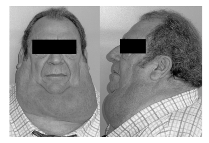
Fig. 1. Symmetric accumulation of fatty tissue in the neck of a patient diagnosed with multiple symmetric lipomatosis.

Very few cases have been reported of MSL associated with SAHS.<sup>2-6</sup> The presence of large fatty deposits in the cervical area would contribute to the narrowing of the upper airway and could interfere with the normal function of the pharyngeal muscles during sleep, favoring the appearance of SAHS. The frequent association of alcoholism and obesity would likewise increase the risk for SAHS. The diagnosis and treatment of SAHS in patients with MSL is especially important due to the increased risk for cardiovascular and metabolic diseases when both diseases are associated. Although cases have been published in which SAHS has improved after surgical treatment of MSL, when we take into account the limited long-term effectiveness of this therapeutic