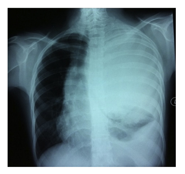
Fig. 1. Plain chest radiography (posteroanterior projection) showing a large opacity that occupies the entire left hemithorax.

almost the entire left hemithorax and caused a deviation of the trachea and the mediastinum towards the right (Fig. 1). Afterwards, computed tomography (CT) exploration better defined this lesion and revealed a solid heterogeneous mass that measured 16 \text{ cm} \times 15 \text{ cm} \times 15 \text{ cm} (Fig. 2). The mass extended to the left supraclavicular region, with no skeletal destruction. It was characterized by smooth edges and it demonstrated a direct relationship with the mediastinal vascular structures, without obliterating them. The left lung was completely collapsed. After CT, the patient underwent magnetic resonance imaging (MRI) for more detailed evaluation. The mass originated at the posterior mediastinum, where it manifested low signal intensity in T1 and high signal intensity that was heterogeneous in the weighted MR images in T2, and, after the administration of gadolinium (0,1 mmol/kg), an intense contrast was demonstrated. We considered that the lesion may possibly have been a lymphoma or, although less likely, a primary lung carcinoma as an initial diagnosis. Positron emission tomography -computed tomography (PET-CT) was ordered, which revealed increased fluorodeoxyglucose (18FFDG) uptake by the mass. For the definitive diagnosis, a biopsy was taken by CT-guided transthoracic needle aspiration. The histopathologic exam revealed layers