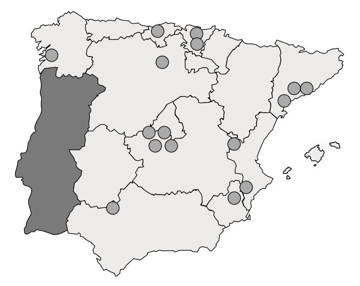
Figure 1. Participating cities in alphabetical order (number of participating sleep units in parentheses): Alicante (2), Barcelona (2), Bilbao (1), Madrid (4) Palencia (1), Requena (1), Santander (1) Seville (1) Terrassa (1), Vigo (1), Vitoria (1).

We designed a cross-sectional study to collect information from various Spanish SUs using a questionnaire on healthcare activity between 2002 and 2008 (both included) in individuals older than 18 years referred for suspected SAHS from any source. The questionnaire included information on four groups: men younger than 65 years of age, men 65 years of age or older, women under 65 and women of 65 or older. The information is expressed as absolute number and percentage of the total or mean and standard deviation as appropriate. It included annual information from 2002 to 2008 (both included) for each group: number of diagnostic studies (either by full polysomnography or respiratory polygraphy), mean age, apnoea-