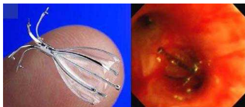
Fig. 1. Appearance of an unfolded IBV valve and endoscopic view after its placement.