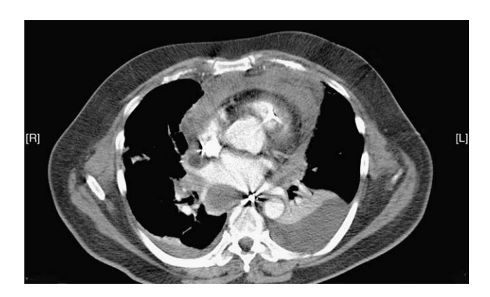
Fig. 1. CT image showing mediastinal widening, collections with air content, pericardial and bilateral pleural effusion and compression atelectasis.

After our experience and the review of the limited bibliography, we would like to conclude by recommending the inclusion of mediastinitis in the differential diagnosis when given suspicion of pancreatitis with the appearance of respiratory symptoms. Due to the high morbidity and mortality of this type of mediastinitis, we recommend aggressive treatment with antibiotic therapy and surgical debridement in addition to exhaustive clinical and