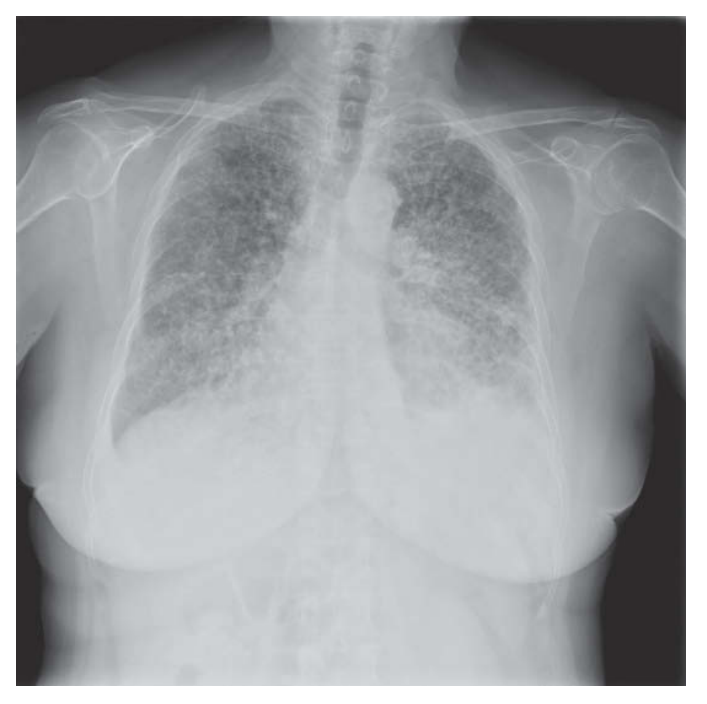
Figure 1. Micronodular X-ray pattern as a manifestation of a lung adenocarcinoma.

and for which a 6-month follow-up was recommended; gynaecological examination ruled out gynaecological pathology; negative precipitins against hen serum, flexible bronchoscopy that only revealed roughlooking mucous of the left main bronchus without signs of infiltration or endobronchial masses. PET: hypermetabolic lesions in both lung parenchyma, mediastinal nodes, infradiaphragmatic nodes, pleura, bone and more uncertainly laterocervical ganglia, highly suspicious of malignancy without completely ruling out infectious aetiology (tuberculosis).