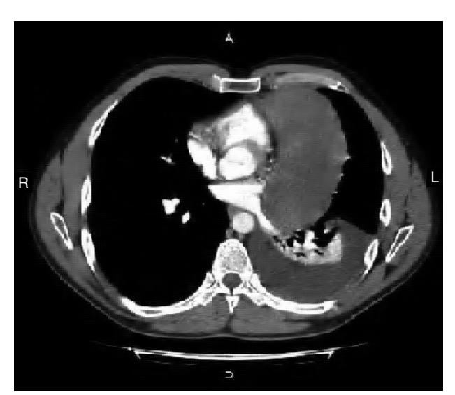
Figure 2. Computed tomography slice showing a tumor in contact with the anterior chest wall, extensive pericardial infiltration, and compression of the pulmonary veins where they enter the atrium.

midline pericardiotomy was carried out in front of the region of tumor infiltration.