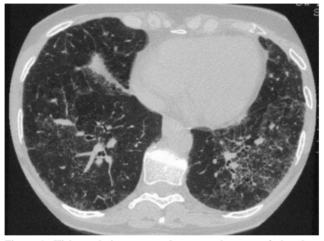
Figure 1. High resolution computed tomography scan of the chest showing thickening of the bronchiolar walls, peribronchovascular reticulation, and ground glass opacities.