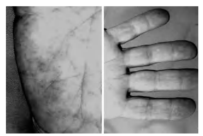
Figure 2. Telangiectasia on hands.