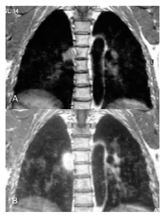
Figure 2. Magnetic resonance image of the chest (cardiac collimation). The T1 weighted image with no gadolinium (A) shows a paravertebral mass with a signal intensity isointense to muscle. The T1 weighted image following administration of gadolinium (B) shows intense heterogeneous contrast enhancement.

The pathogenesis of aneurysms is also unknown. Mention has been made of the onset of a venous hypertrophic process or endothelial phlebosclerosis.<sup>4</sup> Other authors support the hypothesis of congenital weakness or degenerative changes in the venous wall due to abnormalities in the connective tissue.<sup>5</sup> This hypothesis is based on the demonstrated relevance of those factors in the genesis of arterial aneurysms. In