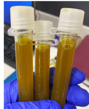
Fig. 1B. Dark green "Bilothorax" pleural fluid.

A 74-year-old man presented with right upper quadrant abdominal pain along with dyspnea for 1 day. Computed tomography of the chest, abdomen, and pelvis demonstrated right-sided pleural effusion (Fig. 1A) and Acute gallstone cholecystitis. Thoracentesis showed dark green pleural effusion (Fig. 1B). Analysis of the fluid revealed pleural bilirubin was 9.5 mg/dl compared with serum bilirubin of 4.7 mg/dl and a diagnosis of bilothorax was made. Cytology was benign and bacterial cultures were negative. The patient underwent chest tube drainage and cholecystectomy. Postoperatively, the patient recovered well and no evidence of recurrent pleural effusion.