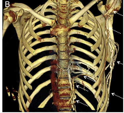
Figure 1. (A) Posterior view 3D volume rendering pulmonary CT angiography demonstrates multiple pulmonary artery aneurisms (arrows). (B) Anterior view 3D volume rendering CT angiography reveals enlarged collateral vessels in the left hemithorax wall and paravertebral areas (dashed arrows). Contrast media performed from left upper extremity reaches the inferior vena cava (IVC) and right atrium via these collateral vessels and the dilated left pherenic vein (dashed arrows). No contrast filling is observed in the SVC.

A 24 year-old male patient presented with a recurrent oral and genital aphthous ulcers. There was a long-standing pain in his knee and elbow joints. The patient also complained of breathlessness at rest and effort. The patient had previously diagnosed Behçet's disease (BD). Chest computed tomography (CT) demonstrated multiple saccular pulmonary artery aneurism sacs especially based on bilaterally hilar-perihilar areas (Fig. 1A). Also no contrast filling was observed in the superior vena cava (SVC) owing to possible thrombus. Enlarged collateral vessels were in the left hemithorax wall and paravertebral areas (Fig. 1B). Venous circulation was reaching the inferior vena cava and right atrium via these collateral vessels, the left pherenic vein, the azygos-hemiazygos veins. There were also enlarged venous collaterals in the upper mediasten and anterior mediasten. Because of