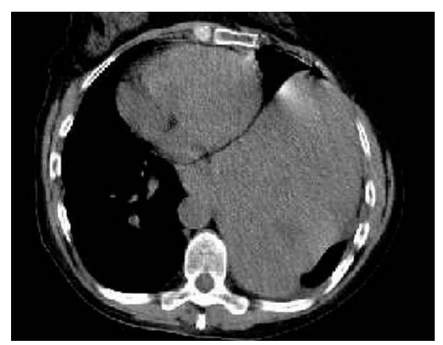
Figure 1. Computed tomography scan of the chest in which a large, heterogeneous mass with well-defined borders can be seen occupying nearly the entire left side of the thorax, displacing mediastinal structures.

All patients had computed tomography (CT) scans of the chest (Figure 1) showing a mass with well-defined borders. Pleural effusion was present in 3 cases. The lesion was biopsied before resection in 4 cases and the results were consistent with a diagnosis of localized fibrous tumor of the pleura in 3 and adenocarcinoma in 1. Mean tumor size measured at the widest point was 9.8 cm (range, 2.5 to 15 cm).