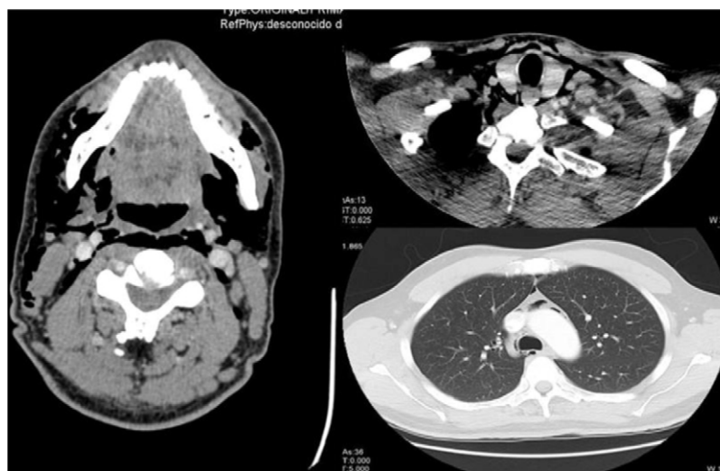
Fig. 1. Cross-sectional CT images of the mandibular, inferior cervical and superior mediastinal areas. There is observed widespread emphysema that dissects the bilateral cervical muscle planes and affects the parapharyngeal and prevertebral spaces, floor of the mouth, submandibular space and posterior cervical space, reaching the mediastinum and causing pneumomediastinum. These findings are asymmetrical and more evident on the right side.

A 30-year-old patient came to the emergency department due to crepitations in the face, neck and thorax after the extraction of the right mandibular third molar the previous day. The patient referred no dyspnea, pain or tumefaction. Upon exploration, the patient was hemodynamically stable, with an oxygen saturation of 100% and evident subcutaneous emphysema on the right side of the face, laterocervical region and right side of the upper thorax. Work-up was normal; cervical and thoracic radiography showed important subcutaneous emphysema and pneumomediastinum, and computed tomography (CT) was done (Fig. 1). The patient was admitted to hospital for prophylactic antibiotics and observation. The evolution was favorable, with a progressive reduction in the emphysema,