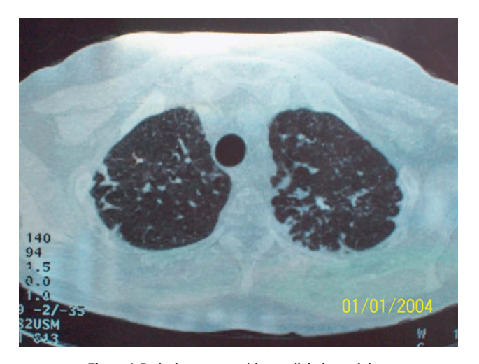
Figure 1. Reticular pattern with centrilobular nodules.

Serum levels of IgG in commercial avian antigens (dove, parakeet, chicken and parrot) and fungi were below those levels considered positive. The prick test (immediate hypersensitivity skin test) carried out to a number of pneumoallergens was negative. Respiratory function tests revealed a restrictive defect with reduced DLCO, FVC of 2,730 (66%), FEV<sub>1</sub>/FVC of 86, FEF 25%-75% of 2,870 (111%), RV of 990 (54%); TLC of 3,390 (65%), DLCO of 13.1 (54%) and KCO of 4.14 (81%), a PI max of 73 (90%) and PE max of 83 (88%). The SO<sub>2</sub> with a FiO<sub>2</sub> of 21% was 98%. The 6-minute walk test showed a desaturation after 600m (at the end of the test, the SO<sub>2</sub> was 88% and heart rate was 134/min).