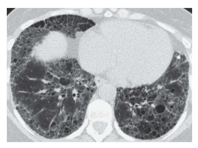
Figure 1. High resolution computerised tomography (HRCT) of patient 1 thorax that shows a peripheral micro cystic pattern that predominates in the bases, with honeycomb and cystic images as well as traction bronchiectasis.

The first case corresponds with a 37 year old female, smoker of 20 packets/year, with no noteworthy pathological background. She worked as a clerk and, for the last 7 years as a jewellery polisher for one year in the company and then in her home, activity which she left two years before consultation. She presented pain in the back and lower side of mechanical nature on applying finger pressure, no fever, cough without expectoration. Auscultation showed bibasal "velcro" crackles and in the exploration, 6 year acropachies. The functional respiratory tests showed a restrictive pattern with decrease in carbon monoxide diffusion (D<sub>1</sub>CO), 53% forced vital capacity (FVC); 63% maximum expiration volume in the first second (FEV<sub>1</sub>); 85% FEV<sub>1</sub>% and 37% D_LCO . The high resolution thorax tomography showed a reticular pattern in bases, with extensive areas of honeycomb lung and bronchiectasis by traction (fig. 1). The bronchoalveolar lavage displayed 42% macrophages, 7% lymphocytes, 39% polymorphonuclears and 12% eosinophils, without evidence of