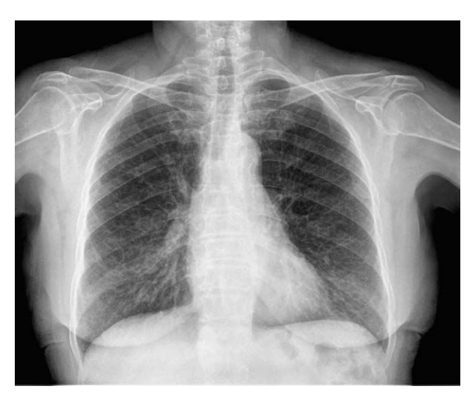
Figure 1. Chest x-ray showing an interstitial pattern.

Notable in her pathological history was an episode of pneumonia 20 years ago and a cerebral tumour intervened and treated with radiotherapy 3 years earlier in another hospital, of which the histiology is unknown and which resulted in left-facial paralysis. Physical exploration was normal, with oxygen saturation of 98%. Discrete cutaneous lesions indicative of angiofibromas were detected in the periorbital region only; lesions were not detected in any other body region. The chest x-ray (Figure 1) showed an interstitial pattern and the computerised tomography (Figure 2) evidenced multiple cystic images throughout the pulmonary field of both hemithorax, morphology round and thin-walled, without vascular structures or septum thickening. Respiratory function exploration showed the forced vital capacity (FVC) was 1,970ml (68% of the theoretical value), the forced expiratory volume (FEV<sub>1</sub>) in the first second was 1,260ml (61% of the theoretical value) with FEV<sub>1</sub>/FVC of 63.65%. A fibrobronchoscopy was performed with bronchoalveolar lavage and transbronchial biopsies.