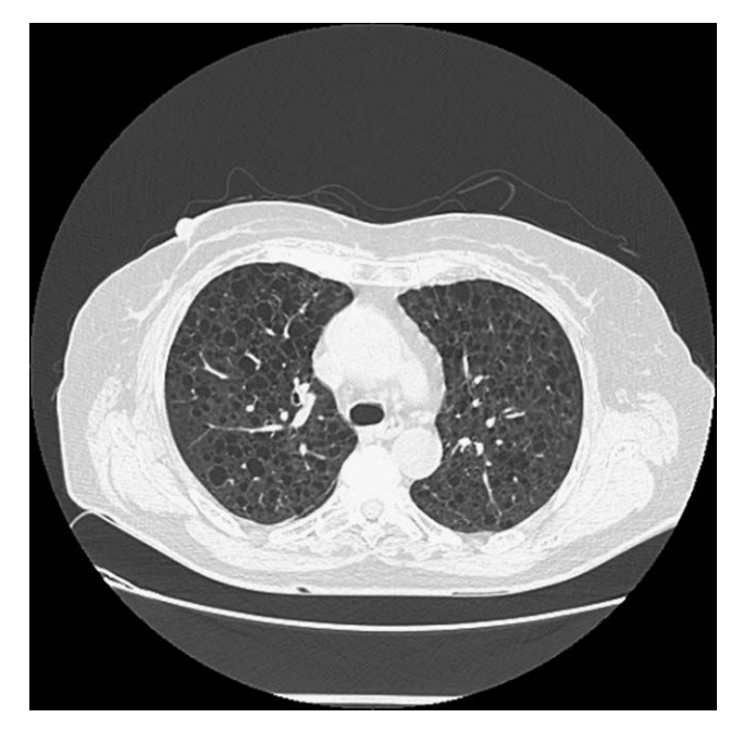
Figure 2. Computerised tomography evidencing multiple cystic images throughout the pulmonary field of both hemithorax.