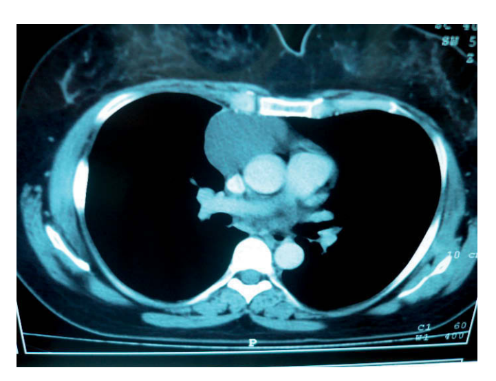
Figure 1. A pericardial cyst of right side, originated in visceral mediastinum and extended into anterior compartment of mediastinum.