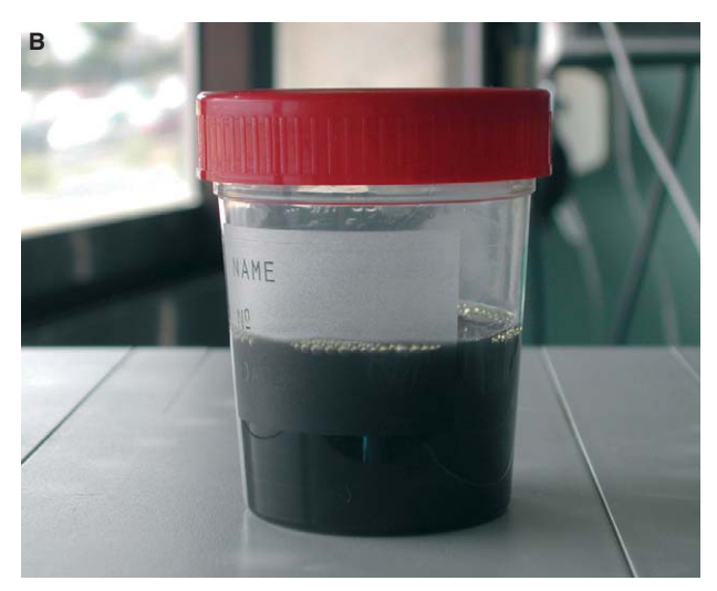
Figure. A: chest radiography at admission to our unit shows diffuse opacification in the right thorax, indicative of right pleural effusion. B: macroscopic characteristics of the fluid taken from the pleural cavity.

Biliothorax is rare in both humans and animals. In fact, a MEDLINE search not limited in time that combined the medical subject headings bile and pleural effusion located only 32 documents, with most in the context of veterinary medicine or biliopleural fistulae secondary to perforated cholecystitis or of choledocholithiasis.1 complications Gallbladder perforation is known to be present in approximately 5% of patients with acute cholecystitis and is associated with a mortality of 27%.2 In recent years, the number of cases has increased with the development of techniques involving the biliary tract. McAllister et al<sup>3</sup> reported right pleural effusion in 33% of patients following uncomplicated laparoscopic cholecystectomy. Biliary fistulae have also been described in up to 0.6% of cases after cholecystectomy.4