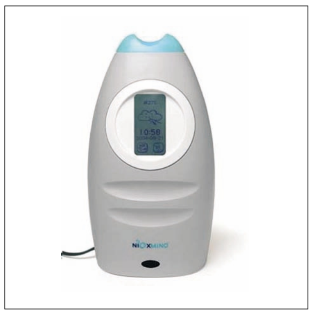
Figure 1. The NIOX-MINO monitor (Aerocrine, Solna, Sweden) for measuring fraction of exhaled nitric oxide.

FE_{NO} findings were expressed as means (SD) and compared with the Mann–Whitney test. Individual results were compared with the Pearson correlation coefficient. All comparisons were bilateral and the usual level of significance of 5% ( \alpha =0.05) was