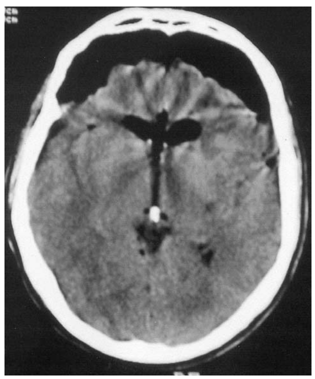
Figure 1. Computed tomography scan of the head showing significant pneumocephalus in the fontal subdural, subarachnoid, and intraventricular spaces. In addition, possible signs of cerebral edema can be observed.

developed cervical pain, headache, temporal-spatial disorientation, and a change in mental status. A CSF fistula was suspected and the patient underwent a second thoracotomy. The fistula tract was found in the costovertebral junction with the third thoracic vertebra (T3) and was filled