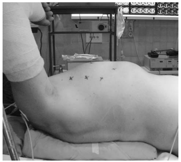
Figure 1. Position of surgical ports.

mortality rates dropped nearly 50% in the first years after Sauerbruch<sup>2</sup> began performing surgical interventions in 1912. In 1939, Blalock et al<sup>3</sup> proposed the systematic use of thymectomy after demonstrating a clear relation between thymectomy and improvement of MG. The introduction of new techniques and specialized intensive care has improved results considerably; the death rate from the condition has fallen from 10% in the 1970s to the current rate of 0% to 2%.<sup>4</sup>