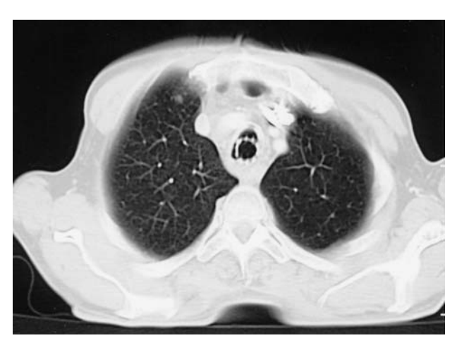
Figure 2. Thoracoabdominal computed tomography scan showing a mediastinal mass extending from the first sternocostal articulation to the left pulmonary artery, surrounding the descending aorta and involving the cephalad portion of the aortic arch, the superior vena cava, and the left brachiocephalic trunk. The tumor infiltrated and obstructed the trachea, necessitating implantation of a tracheal stent.