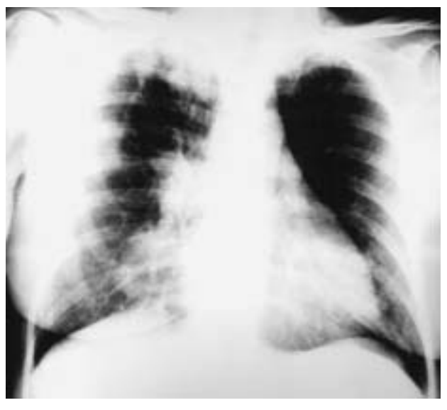
Figure 1. Posteroanterior chest x-ray in which an alveolar infiltrate in the upper right lobe and a lung nodule in the middle lobe can be seen.

clarithromycin were prescribed and she was referred to the outpatient respiratory medicine clinic.