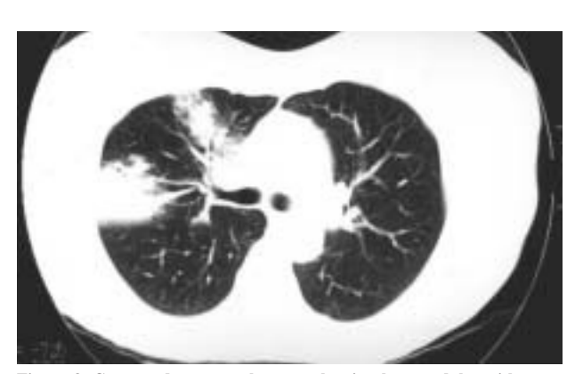
Figure 3. Computed tomography scan showing lung nodules with some areas of cavitation.

admittance to the respiratory medicine ward for further evaluation.