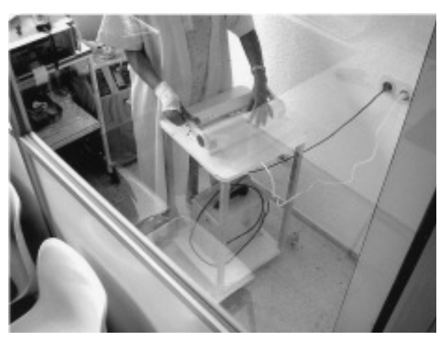
Fig. 1. Provocation chamber and shrink wrapping machine used in the specific challenge test.

Most industrial processes using PVC involve heating the product in order to take advantage of its physical properties. This heating process can give rise to the release of PVC in gaseous form and of irritative products such as hydrochloric acid and carbon monoxide. Exposure to these agents can cause acute intoxication in the central nervous system and irritative